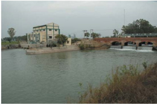
Mini Hydel Power - 135 MW