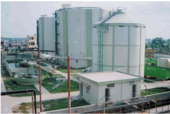
Waste to Energy - 1 MW