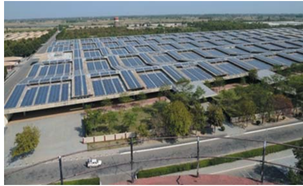
Solar photovoltaic power - 218 MW (Largest Roof top SPV Power Plant at Dera Beas Amritsar - 7.5 MW to be expanded to 20 MW)