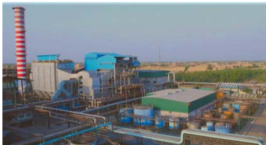
Cogeneration - 410 MW