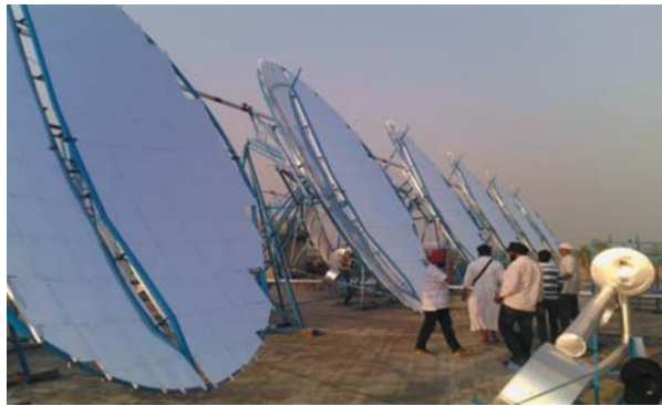
Solar Steam Cooking System - 320 Sq. M