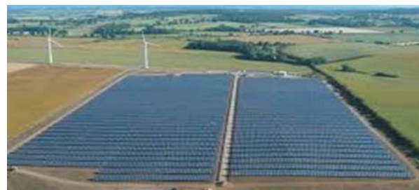
Farmer Solar Power Scheme