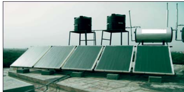
Solar Water Heating Systems - 29 lacs LPD